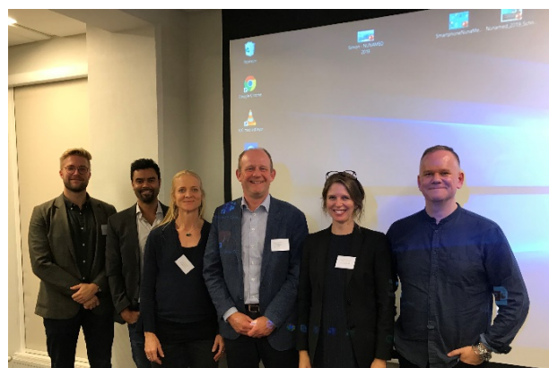
Presenters from the session: Hørelse og Mellemeinfektioner